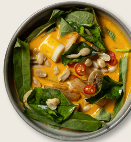
KHMER RED CURRY

n CONTAINS NUTS gf GLUTEN FREE d CONTAINS DAIRY vg VEGAN