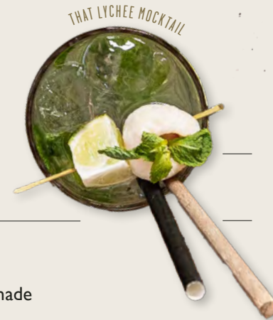
THAT LYCHEE MOCKTAIL