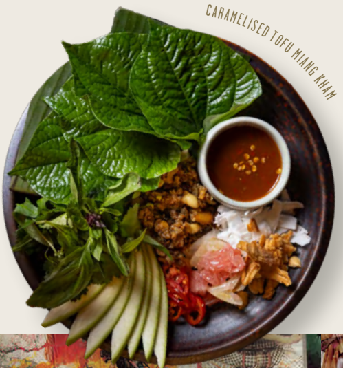
CARAMELISED TOFU MIANG KHAM