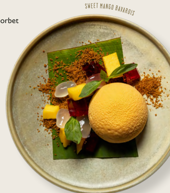
SWEET MANGO BAVAROIS