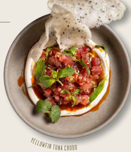
YELLOWFIN TUNA CRUDO

n CONTAINS NUTS gf GLUTEN FREE d CONTAINS DAIRY vg VEGAN