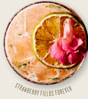
STRAWBERRY FIELDS FOREVER

PIZZINI LAMBRUSCO king valley, vic 70 juicy, balanced, mouth party